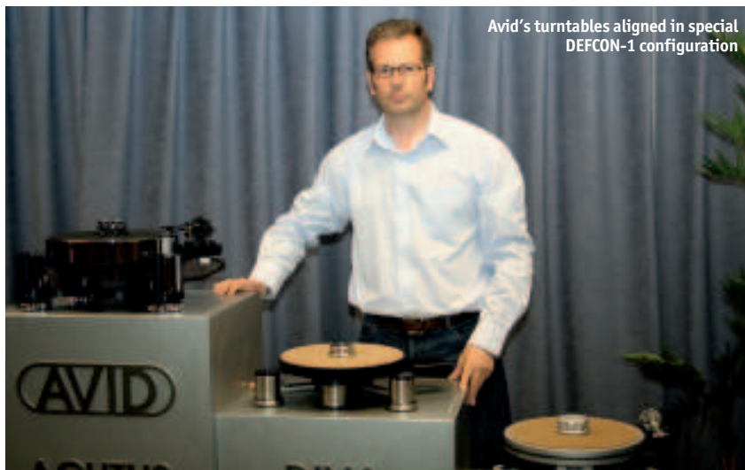
Avid's turntables aligned in special DEFCON-1 configuration

“I sat down with a blank sheet of paper. I had no qualifications or background in engineering. In hindsight I feel this was an advantage.”